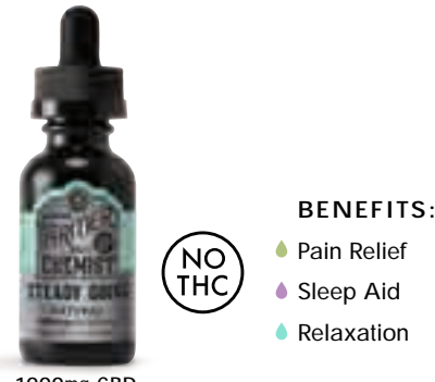
1000mg CBD Natural Flavor