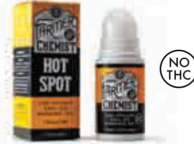
150mg CBD Per Roller