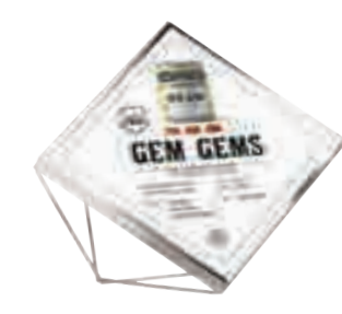
SHELF TALKERS 6"H x 6"W x 2.75"D